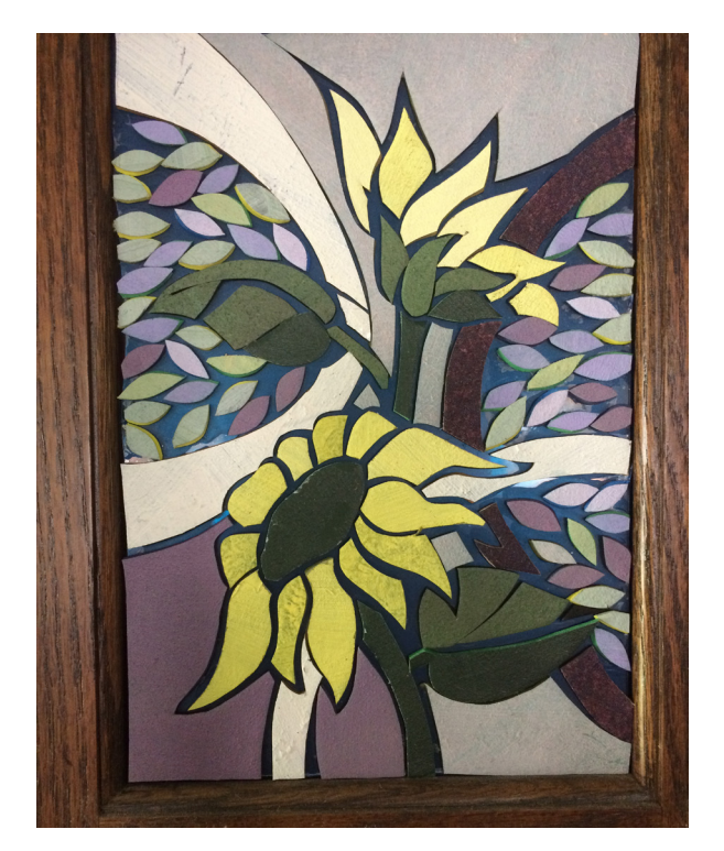
Seeds. (Sunflowers are my favorite flower)